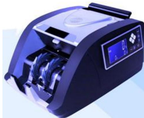
LCD for Cash Machine